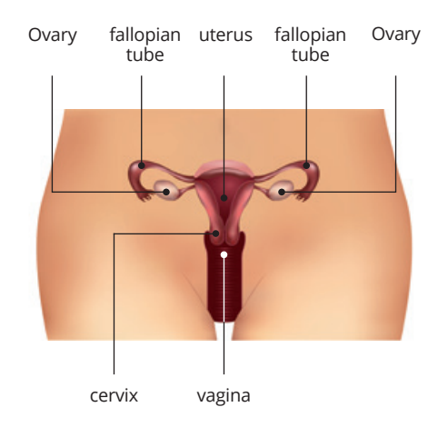
Diagram 1. Location of the cervix

Cervical cancer is the cancer of the neck of the uterus (womb). It is the ninth most common cancer amongst females in Hong Kong.